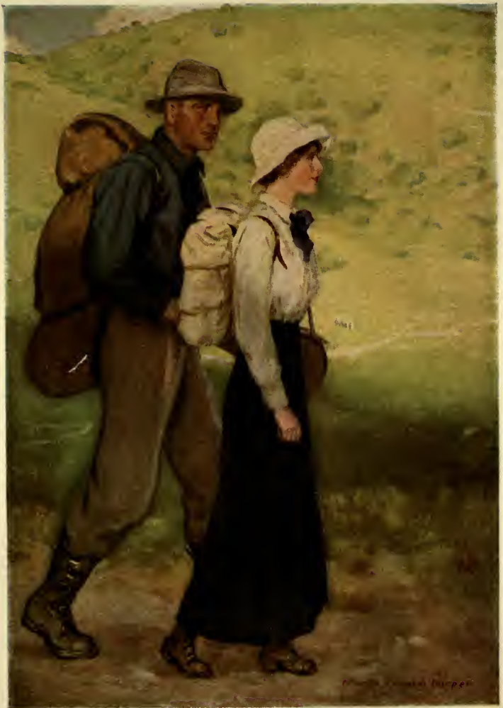
“THE NEXT MORNING THEY WERE EARLY AFOOT”